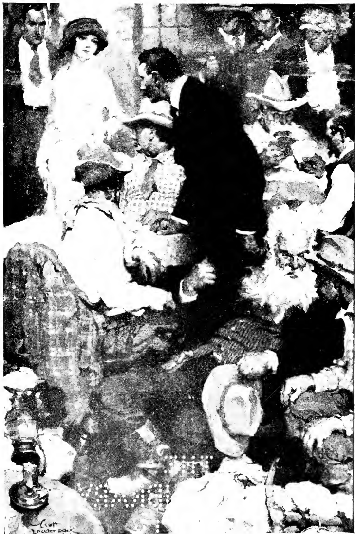
IT WAS AS IF THE MAN WAS DELIBERATELY INSULTING HER